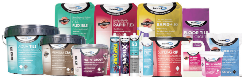
Part of the Bond It Professional Tiling Range