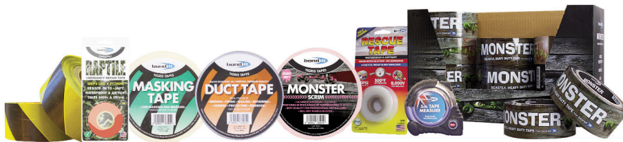
Part of the Bond It Tape Range

The data presented in this leaflet are in accordance with the present state of our knowledge, but do not absolve the user from carefully checking all supplies immediately on receipt. We reserve the right to alter product constants within the scope of technical progress or new developments. The recommendations made in this leaflet should be checked by preliminary trials because of conditions during processing over which we have no control, especially where other companies raw materials are also being used. The recommendations do not absolve the user from the obligation of investigating the possibility of infringement of third parties rights and, if necessary clarifying the position. Recommendations for use do not constitute a warranty, either expressed or implied, of the fitness or suitability of the products for a particular purpose.