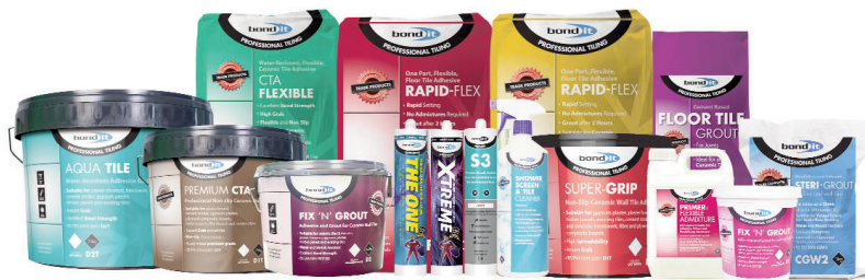
Part of the Bond It Professional Tiling Range

The data presented in this leaflet are in accordance with the present state of our knowledge, but do not absolve the user from carefully checking all supplies immediately on receipt. We reserve the right to alter product constants within the scope of technical progress or new developments. The recommendations made in this leaflet should be checked by preliminary trials because of conditions during processing over which we have no control, especially where other companies raw materials are also being used. The recommendations do not absolve the user from the obligation of investigating the possibility of infringement of third parties rights and, if necessary clarifying the position. Recommendations for use do not constitute a warranty, either expressed or implied, of the fitness or suitability of the products for a particular purpose.