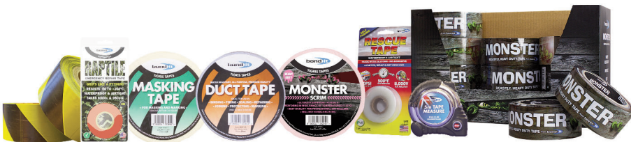
Part of the Bond It Tape Range

The data presented in this leaflet are in accordance with the present state of our knowledge, but do not absolve the user from carefully checking all supplies immediately on receipt. We reserve the right to alter product constants within the scope of technical progress or new developments. The recommendations made in this leaflet should be checked by preliminary trials because of conditions during processing over which we have no control, especially where other companies raw materials are also being used. The recommendations do not absolve the user from the obligation of investigating the possibility of infringement of third parties rights and, if necessary clarifying the position. Recommendations for use do not constitute a warranty, either expressed or implied, of the fitness or suitability of the products for a particular purpose.