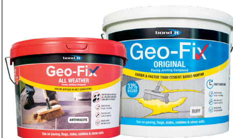
Part of the Bond It Geo-Fix® Range

Note: The data presented in this leaflet is in accordance with the present state of our knowledge, but does not absolve the user from carefully checking all supplies immediately on receipt. We reserve the right to alter product constants within the scope of technical progress or new developments. The recommendations made in this leaflet should be checked by preliminary trials because of conditions during processing over which we have no control, especially where other companies raw materials are also being used. The recommendations do not absolve the user from the obligation of investigating the possibility of infringement of third parties rights and, if necessary clarifying the position. Recommendations for use do not constitute a warranty, either expressed or implied, of the fitness or suitability of the products for a particular purpose.